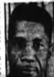
Coverage of Medgar Evers' death in Jackson, Mississippi paper